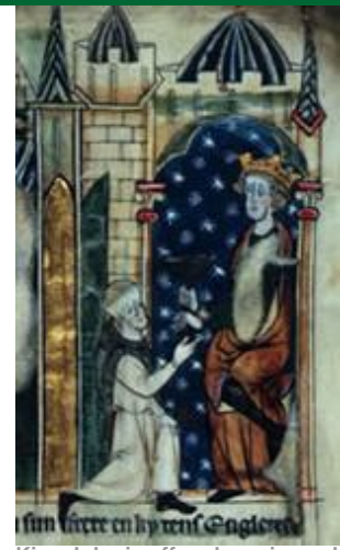
King John is offered a poisoned chalice: Chronicles, c.1280-1300 British Library Cotton MS Vitellius A.xiii, f.5v (detail)

(26) If at the death of a man who holds a lay 'fee' of the Crown, a sheriff or royal official produces royal letters patent of summons for a debt due to the Crown, it shall be lawful for them to seize and list movable goods found in the lay 'fee' of the dead man to the value of